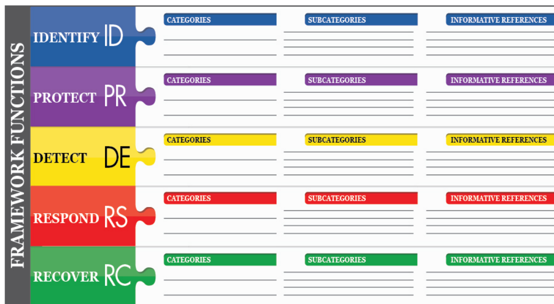
Figure 1: Framework Core Structure

The Framework Core provides a set of activities to achieve specific cybersecurity outcomes, and references examples of guidance to achieve those outcomes. The Core is not a checklist of actions to perform. It presents key cybersecurity outcomes identified by industry as helpful in managing cybersecurity risk. The Core comprises four elements: Functions, Categories, Subcategories, and Informative References, depicted in Figure 1 :